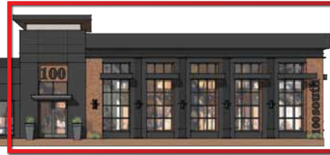
NEW FACADE RENDERING